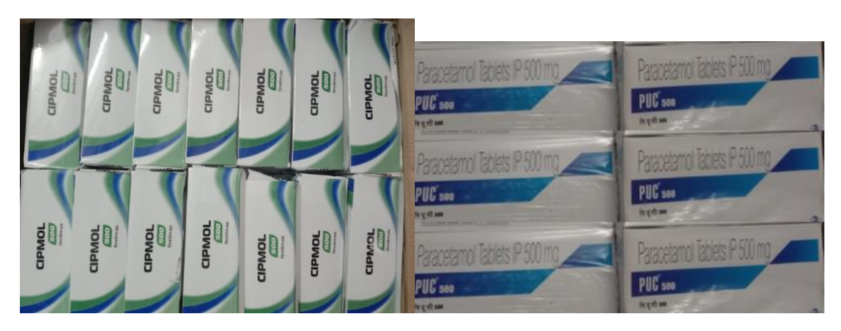
A few medicines supplied