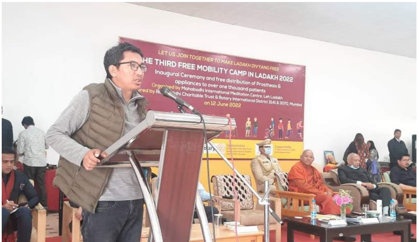
Member of Parliament, Ladakh, Jamyang Tsering Namgyal