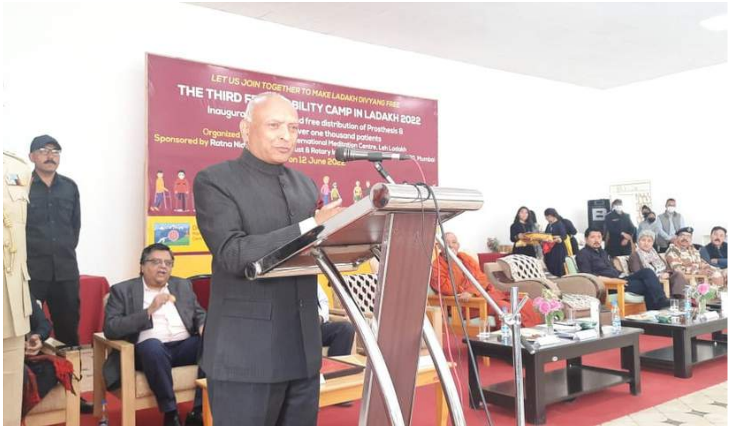
Honorable Chief Guest, H.E. Shri. R.K. Mathur, Lt. Governor of U.T. of Ladakh