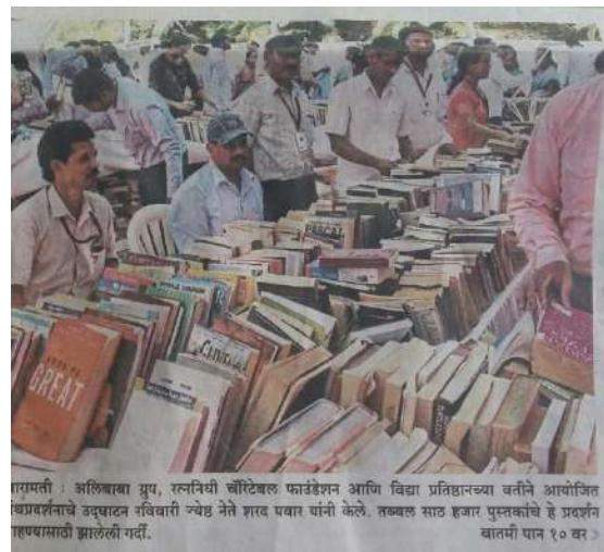
बारामती : अलिबाबा ग्रुप, रत्ननिधी चॉरिटेबल फाउंडेशन आणि विद्या प्रतिष्ठानच्या जतीने आयोजित ग्रंथप्रदर्शनाचे उद्घाटन शरद पवार यांनी केले. तब्बल साठ हजार पुस्तकांचे हे प्रदर्शनी सभागृहातही झालेली गेई.

अज्ञानाची जडोवा... असे पवार यांनी या वेळी म्हणून सांगितले. त्याच काळातच वरील निदेशाप्रमाणे व हायड्राबादला अज्ञानाचे घातपातीतही केला जाई. अज्ञानाचे घातपातीतही केला जाई. अज्ञानाचे घातपातीतही केला जाई. बेचाळीस हजार पुस्तके नेलीसुद्धा! एवढेच अज्ञानाचे घातपातीतही केला जाई. अज्ञानाचे घातपातीतही केला जाई. अज्ञानाचे घातपातीतही केला जाई.