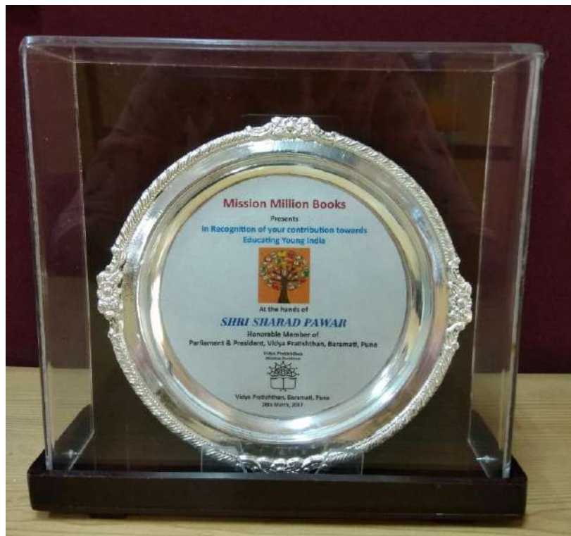
Trophy handed over to the dignitaries.