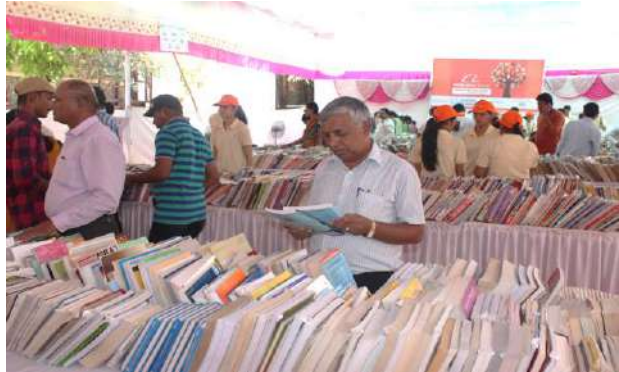
The MMB exhibition setup and teachers browsing through the books displayed at the venue